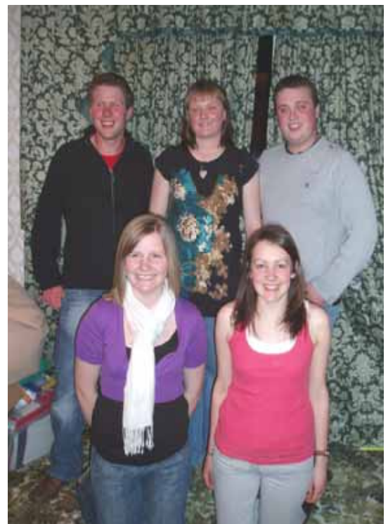
Incoming UK exchangees 2009