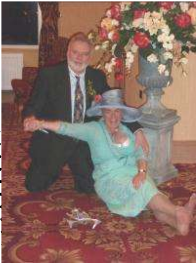
The bride's mother gets a little tired and emotional.

The 53rd annual UK reunion took place from Friday 23rd to Monday 26th October 2009 at the Gosford Park Hotel near Newcastle –Upon-Tyne. Over the weekend there were agricultural visits to an organic beef and sheep farm, a dairy farm and a farmhouse bed and breakfast business which runs mainly on renewable energy and for the history buffs there was also a tour to the Roman Fort at Vindolanda. Of course throughout the weekend there was much fun and frolics with fancy dress, ceili dancing and most importantly the chance to meet old and new friends. For a full report and photos see the IFYE website.