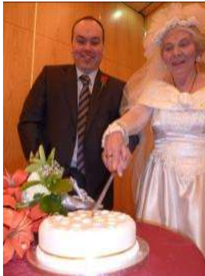
The Happy Couple

The groom and his right hand men—any woman would be lucky to have any of them!