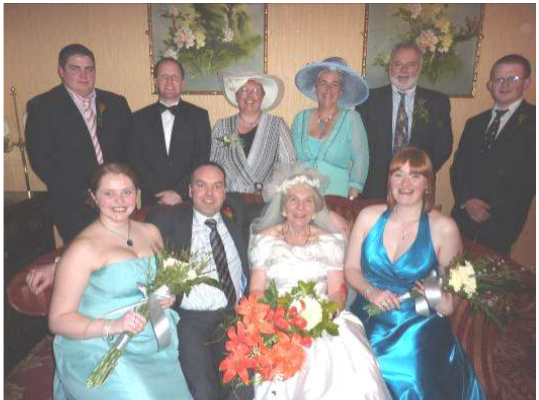
The Wedding Party (more photos inside)